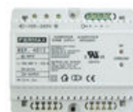
F04813 P.S.U. DIN6 100-240VAC/12VDC-2A