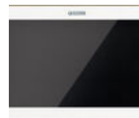
F14831 WIT 10' HOME AUT. MONITOR POE WHITE MEET