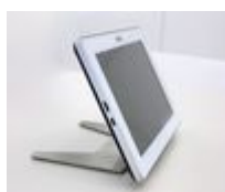
F01485 MEET MONITOR DESKTOP SUPPORT