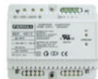
F04813 P.S.U. DIN6 100-240VAC/12VDC-2A