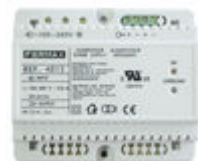
F04813 P.S.U. DIN6 100-240VAC/12VDC-2A