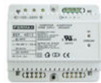
F04813 P.S.U. DIN6 100-240VAC/12VDC-2A