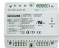
F04813 P.S.U. DIN6 100-240VAC/12VDC-2A