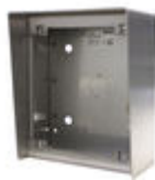
F04645 MARINE ST1 SURFACE BOX