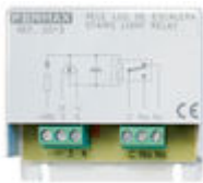
F02013 ADDITIONAL FUNCTIONS RELAY