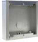
F07061 CITY S1 SURFACE BOX