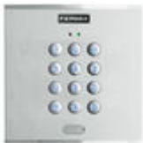
F06991 CITYLINE MEMOKEY