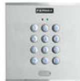
F06991 CITYLINE MEMOKEY