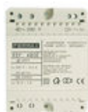
F04802 P.S.U. DIN4 230VAC/12VAC-1A