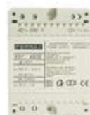
F04802 P.S.U. DIN4 230VAC/12VAC-1A