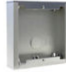
F07061 CITY S1 SURFACE BOX