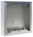
F07061 CITY S1 SURFACE BOX