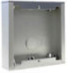
F07061 CITY S1 SURFACE BOX