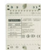
F04802 P.S.U. DIN4 230VAC/12VAC-1A