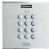
F06991 CITYLINE MEMOKEY