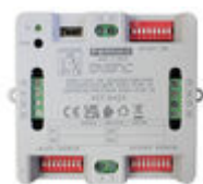
F09425 4W DUOX PLUS DECODER/ISOLATOR