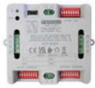
F09425 4W DUOX PLUS DECODER/ISOLATOR