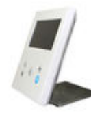
F09420 VEO-XS/VEO-XL MONITOR DESKTOP SUPPORT