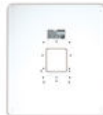
F03389 UNIVERSAL FRAME LARGE