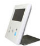
F09420 VEO-XS/VEO-XL MONITOR DESKTOP SUPPORT