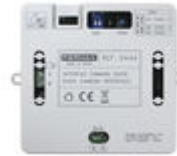
F09444 DUOX PLUS CAMERA INTERFACE