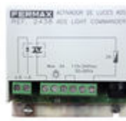
F02438 VDS LIGHT/BUZZER ACTIVATOR