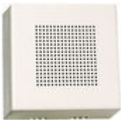
F02040 ELECTRONIC EXTENSION CALL