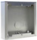
F07061 CITY S1 SURFACE BOX