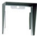
F08400 CITY SINGLE HOOD S1