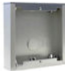
F07061 CITY S1 SURFACE BOX