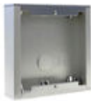
F07061 CITY S1 SURFACE BOX