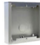
F07061 CITY S1 SURFACE BOX