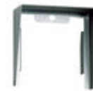
F08400 CITY SINGLE HOOD S1