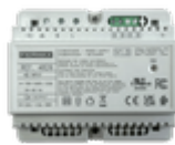
F04826 ALIMENTADOR+FILTRO DIN6 24VDC-1.5A