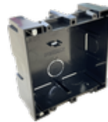
F08948 CAJA EMPOTRAR CITY KIT S1