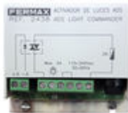
F02438 ACTIVADOR LUCES-TIMBRE VDS