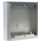
F07061 CAJA SUPERFICIE CITY S1