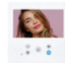
F09469 MONITOR VEO-XL WIFI 7" DUOX PLUS