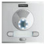
F40008 CITY PANEL DUOX PLUS S1 CP201