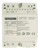
F04802 ALIMENTADOR DIN4 230VAC/12VAC-1A