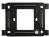
F95411 NEO/WIT MONITOR CONNECTOR MEET