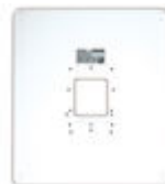
F03389 UNIVERSAL FRAME LARGE