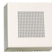
F02040 ELECTRONIC EXTENSION CALL