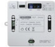
F09444 DUOX PLUS CAMERA INTERFACE