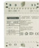
F04802 P.S.U. DIN4 230VAC/12VAC-1A