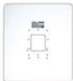
F03389 UNIVERSAL FRAME LARGE