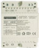
F04802 P.S.U. DIN4 230VAC/12VAC-1A