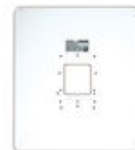
F03389 UNIVERSAL FRAME LARGE