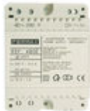
F04802 P.S.U. DIN4 230VAC/12VAC-1A