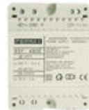
F04802 P.S.U. DIN4 230VAC/12VAC-1A