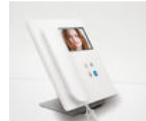
F09410 VEO MONITOR DESKTOP SUPPORT