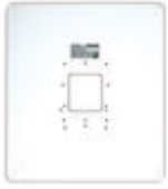
F03389 UNIVERSAL FRAME LARGE