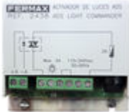
F02438 VDS LIGHT/BUZZER ACTIVATOR