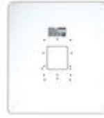
F03389 UNIVERSAL FRAME LARGE