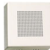
F02040 ELECTRONIC EXTENSION CALL