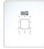
F03389 UNIVERSAL FRAME LARGE