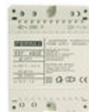
F04802 P.S.U. DIN4 230VAC/12VAC-1A