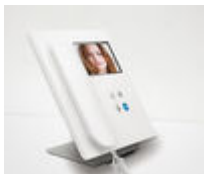
F09410 VEO MONITOR DESKTOP SUPPORT