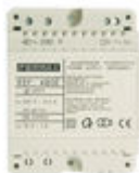
F04802 P.S.U. DIN4 230VAC/12VAC-1A