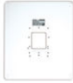
F03389 UNIVERSAL FRAME LARGE