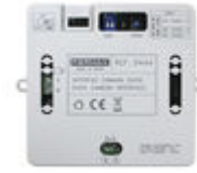
F09444 DUOX PLUS CAMERA INTERFACE