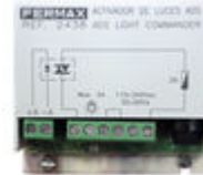
F02438 VDS LIGHT/BUZZER ACTIVATOR