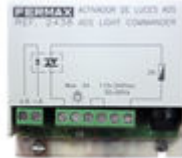
F02438 VDS LIGHT/BUZZER ACTIVATOR