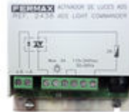
F02438 VDS LIGHT/BUZZER ACTIVATOR