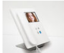
F09410 VEO MONITOR DESKTOP SUPPORT