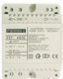
F04802 P.S.U. DIN4 230VAC/12VAC-1A