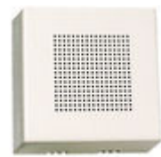
F02040 ELECTRONIC EXTENSION CALL