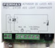
F02438 VDS LIGHT/BUZZER ACTIVATOR