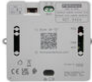
F09454 IP/DUOX PLUS CAMERA INTERFACE