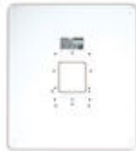
F03389 UNIVERSAL FRAME LARGE