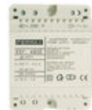
F04802 P.S.U. DIN4 230VAC/12VAC-1A