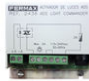
F02438 VDS LIGHT/BUZZER ACTIVATOR