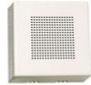
F02040 ELECTRONIC EXTENSION CALL