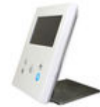
F09420 VEO-XS/VEO-XL MONITOR DESKTOP SUPPORT