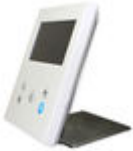
F09420 VEO-XS/VEO-XL MONITOR DESKTOP SUPPORT