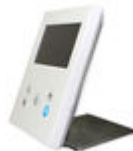
F09420 VEO-XS/VEO-XL MONITOR DESKTOP SUPPORT