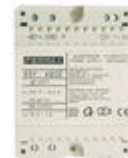
F04802 P.S.U. DIN4 230VAC/12VAC-1A