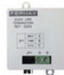
F03255 DUOX PLUS LINE ADAPTOR