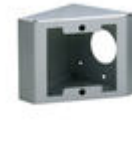
F08378 CITY SINGLE ANGLE BOX S1