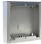
F07061 CITY S1 SURFACE BOX