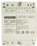
F04802 P.S.U. DIN4 230VAC/12VAC-1A