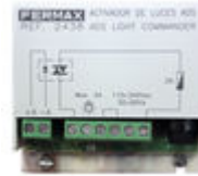
F02438 VDS LIGHT/BUZZER ACTIVATOR