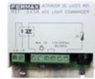
F02438 VDS LIGHT/BUZZER ACTIVATOR