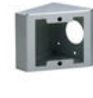
F08378 CITY SINGLE ANGLE BOX S1