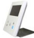
F09420 VEO-XS/VEO-XL MONITOR DESKTOP SUPPORT