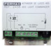
F02438 VDS LIGHT/BUZZER ACTIVATOR