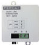
F03255 DUOX PLUS LINE ADAPTOR