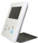
F09420 VEO-XS/VEO-XL MONITOR DESKTOP SUPPORT