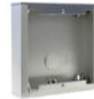
F07061 CITY S1 SURFACE BOX