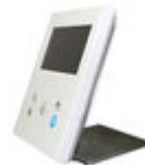
F09420 VEO-XS/VEO-XL MONITOR DESKTOP SUPPORT