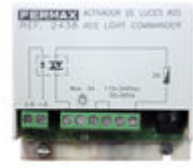
F02438 VDS LIGHT/BUZZER ACTIVATOR