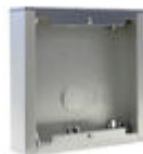
F07061 CITY S1 SURFACE BOX