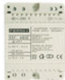
F04802 P.S.U. DIN4 230VAC/12VAC-1A