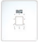
F03389 UNIVERSAL FRAME LARGE