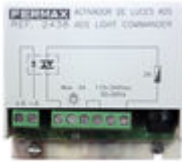
F02438 VDS LIGHT/BUZZER ACTIVATOR