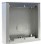
F07061 CITY S1 SURFACE BOX